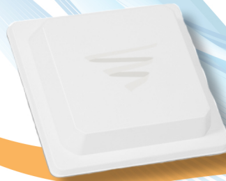
X-WAV FP Series Flat Panel Patch Indoor or outdoor mounting 2.4 GHz, 7 & 14 dBi; 5 GHz, 7, 13 & 18 dBi