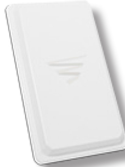
X-WAV FPS Series Flat Panel Sectors Indoor or outdoor mounting 2.4 & 5 GHz models, 7-18 dBi