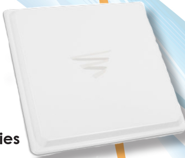
X-WAV FPS-M Series Flat Panel MIMO High capacity WiFi MIMO transmissions 2.4 & 5 GHz models, 11 & 13 dBi