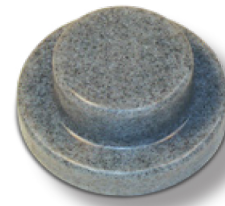
X-WAV OH Series Hemispherical Omni Easy to install indoors or outside 7 dBi gain, 2.4 GHz