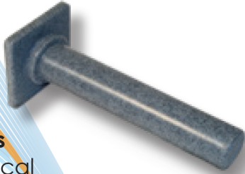
X-WAV H Series Directional Helical Narrow beamwidth for Point-to-Point 2.4 GHz, 10 & 13 dBi gain

The X-WAV & TMA Series antennas feature Circular Polarization technology, including superior signal propagation and penetration, with less susceptibility to outside interference and multipath signals. CP antennas transmit on all planes, making it easier to establish a reliable signal link regardless of the device antenna's orientation.